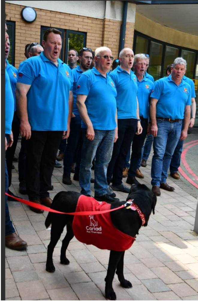
Côr Meibion Machynlleth