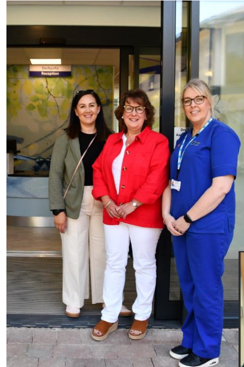
Staff past and present