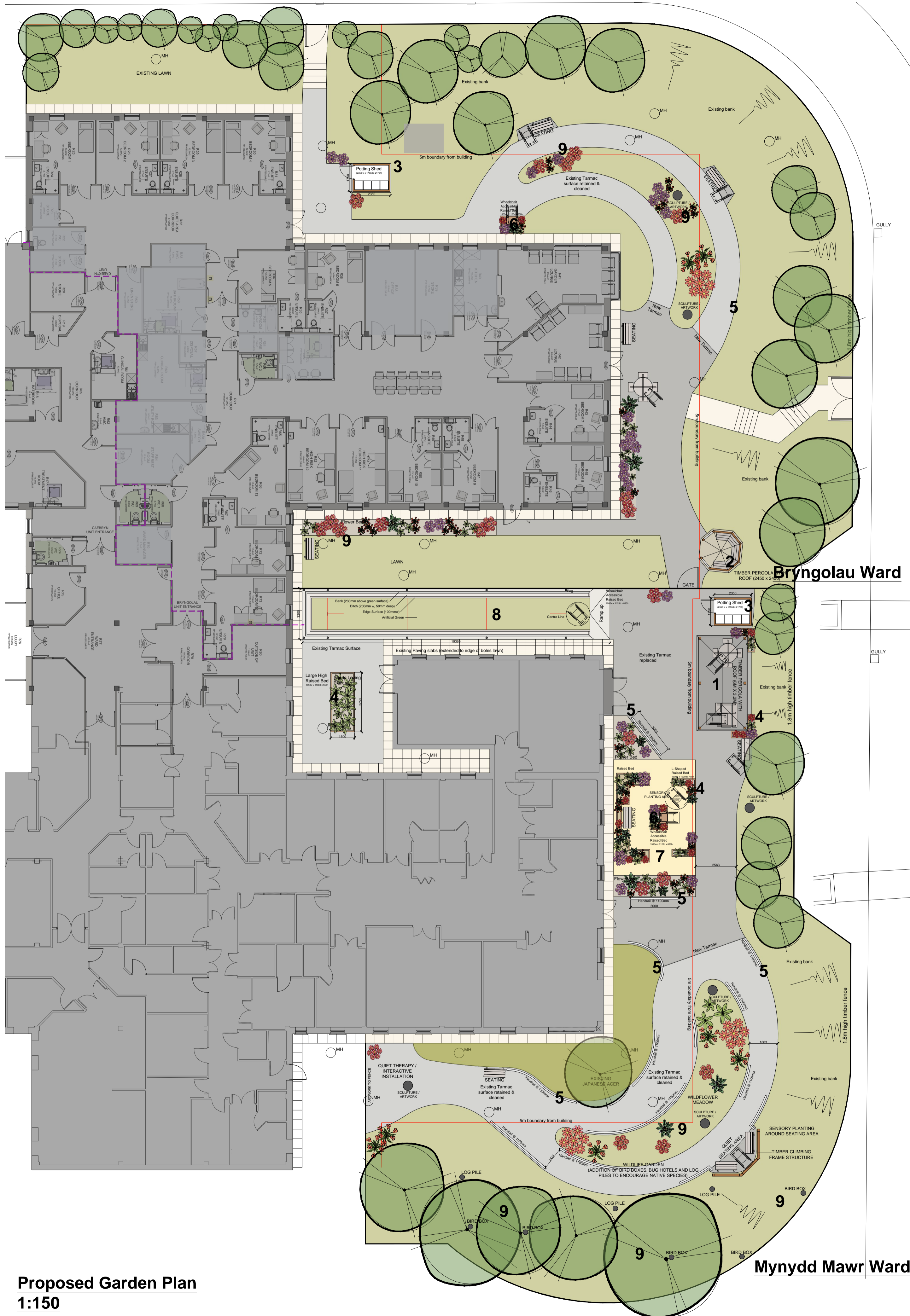
Proposed Garden Plan 1:150