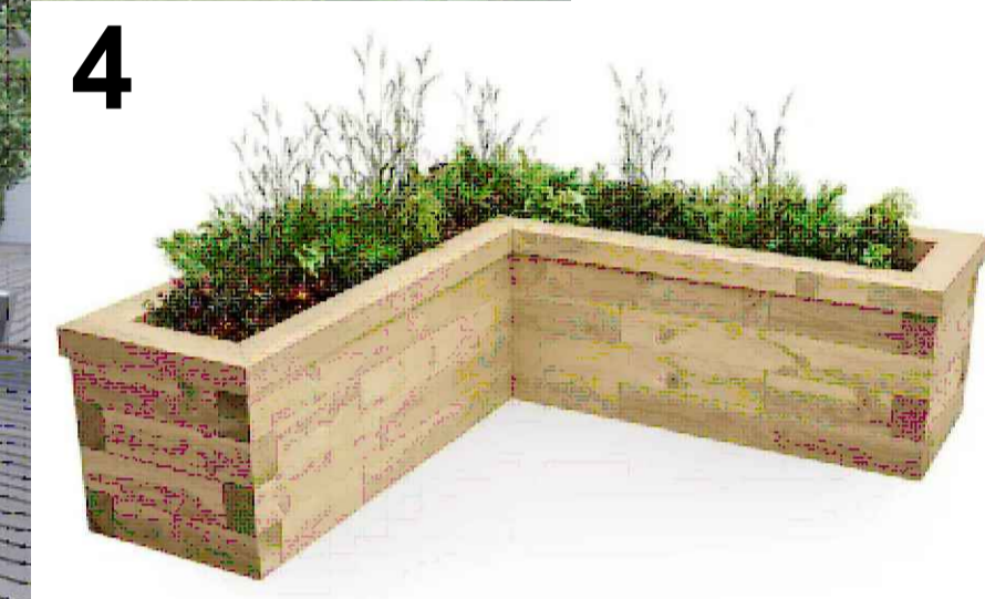
Wellbeing 1. Potting shed/garden activities to keep users active and engaged. 2. Raised planters for both sensory and edible planting, to evoke memory and provide colour, smell, touch.