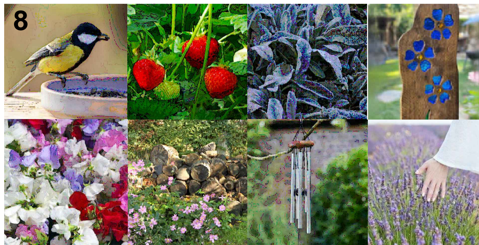
A garden for all five senses 1. planting, artwork and installations designed to stimulate senses, and evoke memory 2. bird feeders and colorful low maintenance planting to create visual impact and stimulation 3. native rich planting and feeders to encourage birds and other wildlife to provide sound. Option for wind chimes. Consider use of water if permitted. 4. Areas for edible planting, herbs and fruits to stimulate sight, touch, smell and taste. 5. Tactile and varied planting touch senses. Areas of grass to vary textures underfoot. 6. Artwork and sculpture designed to provide triggering memory (i.e. recalling a childhood game or activity)