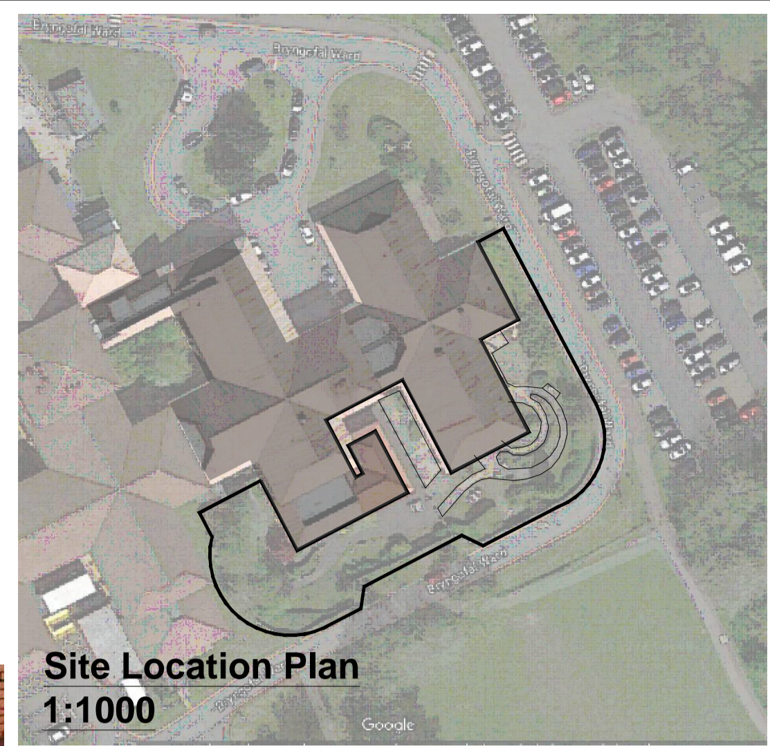
Site Location Plan 1:1000