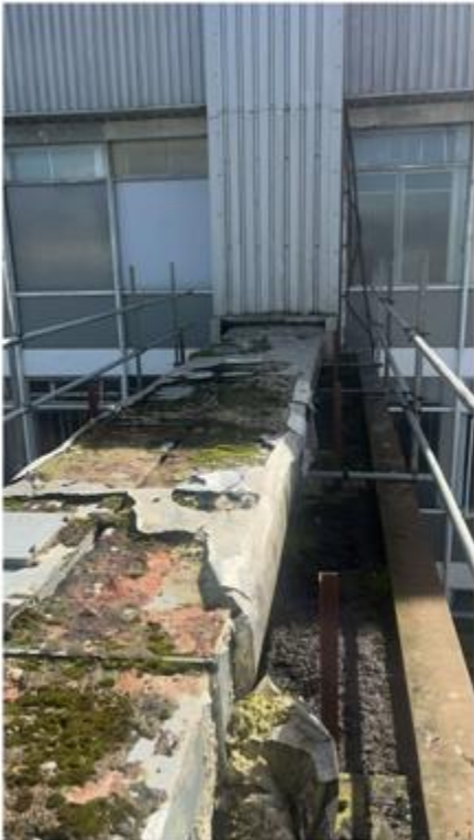
Air Handling Unit, Glangwili